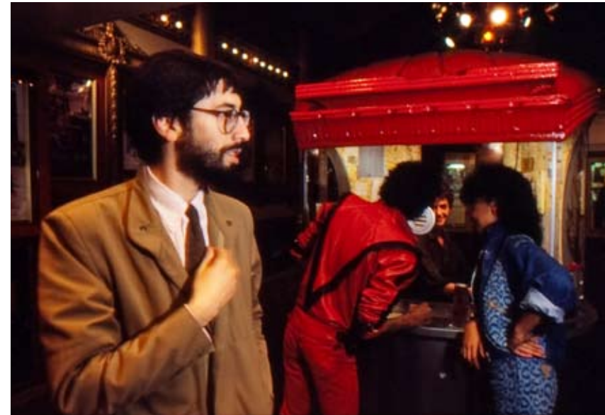
Fusce interdum. Maecenas eu elit sed nulla dignissim interdum. Sed laoreet. Aenean pede. Phasellus porta. Ut dictum nonummy diam.