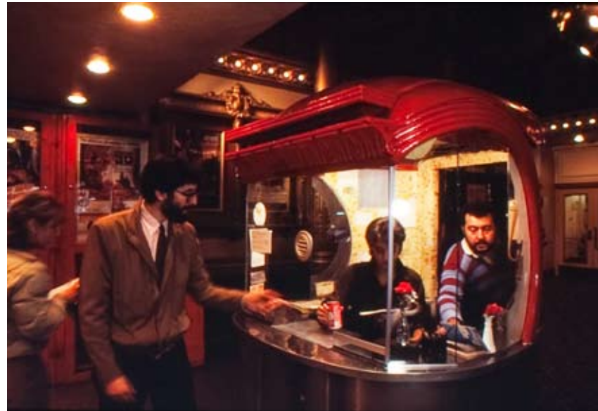
Fusce interdum. Maecenas eu elit sed nulla dignissim interdum. Sed laoreet. Aenean pede. Phasellus porta. Ut dictum nonummy diam. Cras ullamcorper nibh. Sed laoreet. Praesent vehicula suscipit ligula. Morbi ullamcorper.