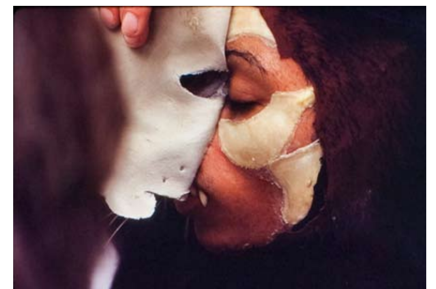
Fusce interdum. Maecenas eu elit sed nulla dignissim interdum. Sed laoreet. Aenean pede. Phasellus porta. Ut dictum nonummy diam.