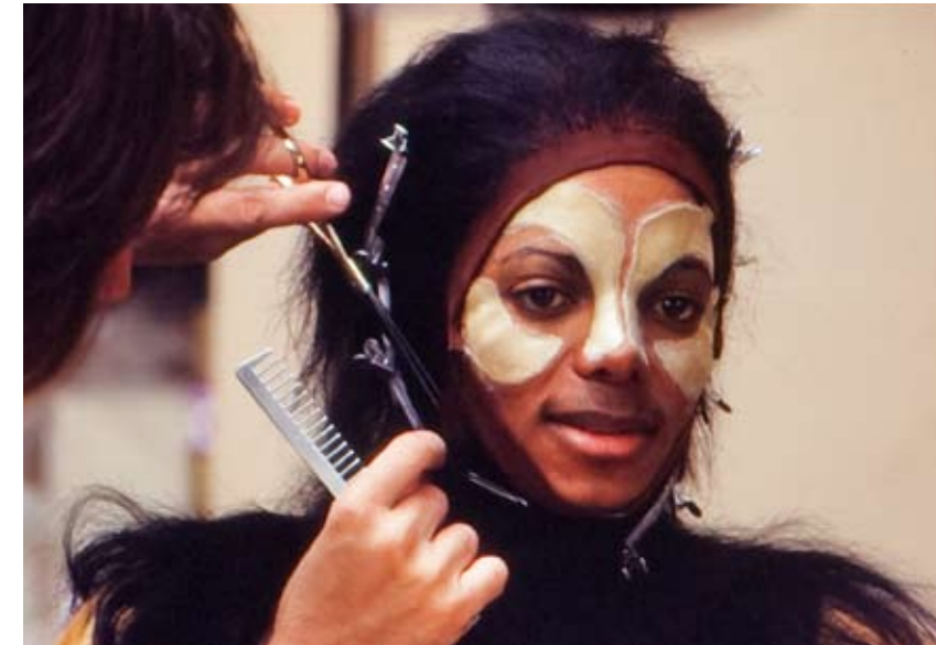
Fusce interdum. Maecenas eu elit sed nulla dignissim interdum. Sed laoreet. Aenean pede. Phasellus porta. Ut dictum nonummy diam. Sed a leo. Cras ullamcorper nibh. Sed laoreet. Praesent vehicula suscipit ligula. Morbi ullamcorper.