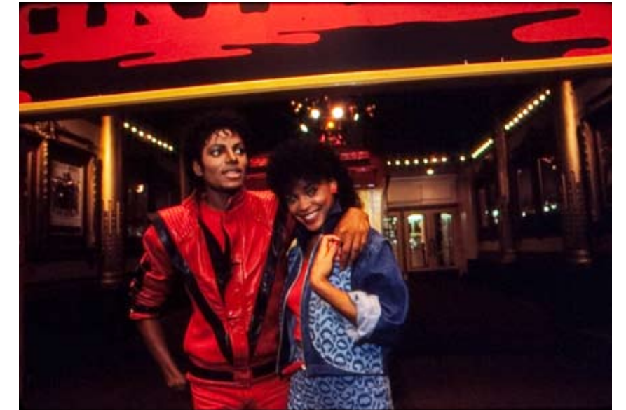
Fusce interdum. Maecenas eu elit sed nulla dignissim interdum. Sed laoreet. Aenean pede. Phasellus porta. Ut dictum nonummy diam. Sed a leo. Cras ullamcorper nibh. Sed laoreet. Praesent vehicula suscipit ligula. Morbi ullamcorper.