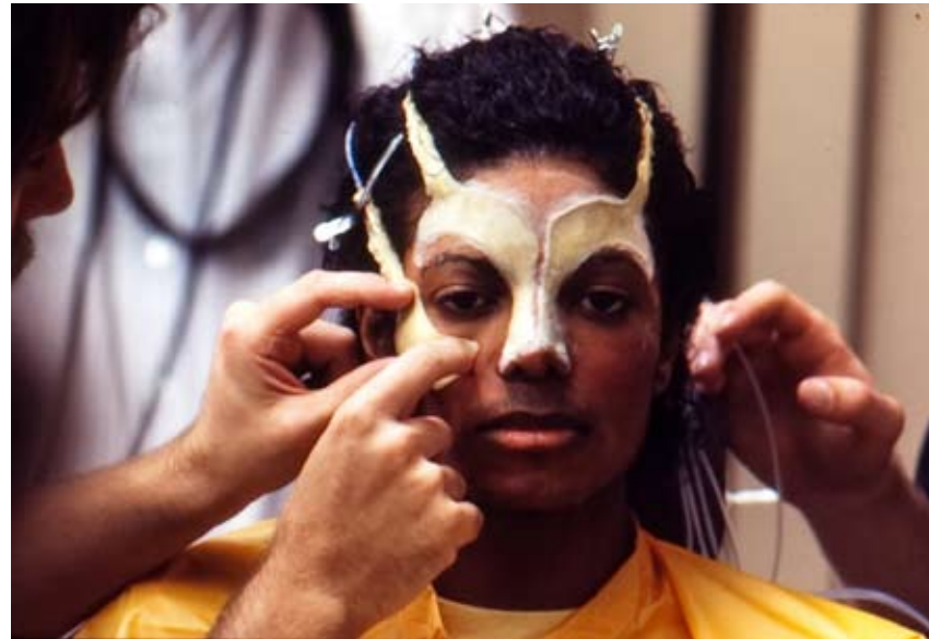
Fusce interdum. Maecenas eu elit sed nulla dignissim interdum. Sed laoreet. Aenean pede. Phasellus porta. Ut dictum nonummy diam. Cras ullamcorper nibh. Sed laoreet. Praesent vehicula suscipit ligula. Morbi ullamcorper.