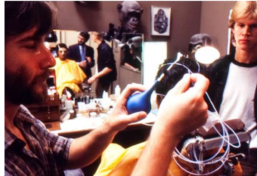
Fusce interdum. Maecenas eu elit sed nulla dignissim interdum. Sed laoreet. Aenean pede. Phasellus porta. Ut dictum nonummy diam.